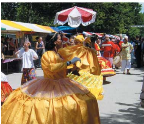
Maracatu Leao Coroado from Brazil at Amsterdam Roots

Koninginnedag The queen's birthday (April 30). Open-air fleamarket and music covering the whole inner city.