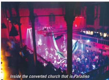
Inside the converted church that is Paradiso

Melkweg Cradle of world music before the term was invented, today a hot spot for rock, dance, Afro and Latin. Check out ¿Que pasa? club night on Thursdays (Lijnbaansgracht 234a, +31 20 531 8181, www.melkweg.nl ).