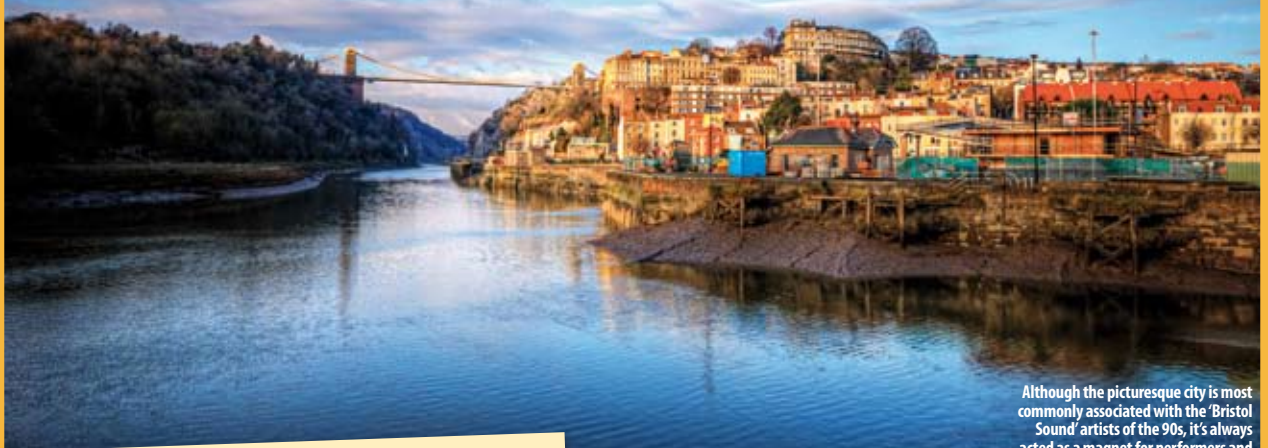
Although the picturesque city is most commonly associated with the 'Bristol Sound' artists of the 90s, it's always acted as a magnet for performers and boasts a wide-reaching and diverse hub of musical culture

The recession seems to have had little impact on the musical nightlife of Bristol. Pick up local listings magazine Venue and you'll find a bewildering mix of visiting attractions and home-grown talent playing at venues ranging from the 2,000 capacity Colston Hall down to intimate pubs and bars. Many gigs are cheap or even free, but don't overlook them for that reason: most venues have a quality standard that ensures a good night's entertainment.