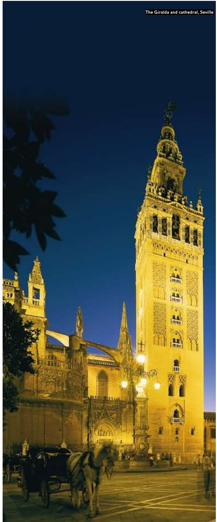
The Giralda and cathedral, Seville

All Songlines Music Travellers will receive an information sheet about the local music, plus recommended recordings and DVDs.